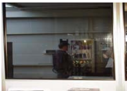
The observer one does not see the observer

Spymirror is a single side coated one way mirror which is used as partition between a supervised and an observation area (20% additional to cover an information display or a TV). The reflection of the coated side is higher than for the glass side. Thus the observer can look clearly into a bright illuminated area (at least lighting ratio between the areas 1:5, 20% = 1:10, 30% and 40% = 1:15), while for the observant the partition acts as a mirror.