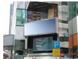
Display is turned off, there is only a mirror to see