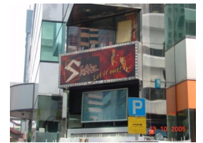
Display is on, clear view